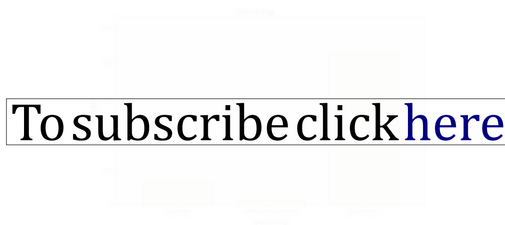
FIGURE 1. Smoking status of respondents

As for occupational status, 43.6% were employees of different sectors excluding physicians who showed only 0.7% of responses. The rest of the participants were either unemployed or students of different specialties. Regarding chronic illnesses, the majority (44.7%) reported having unspecified lung diseases followed by hypertension (27%), while 26.2% reported having no chronic illnesses. Asthma, diabetes, high cholesterol and heart disease formed less than 50% of the cases. Moreover, most of the respondents were non-smokers holding a very high rate of 84.8% (see figure 1).