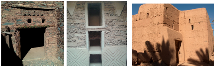
FIGURE 4. Traditional house in the rural communities of Guelmim