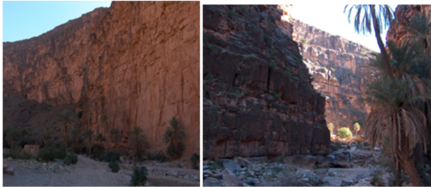
FIGURE 7. Id Aïssa Gorges in the rural commune of Amtedi-Guelmim