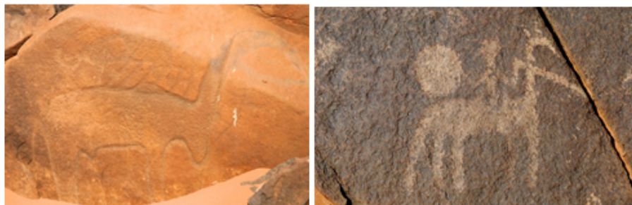
FIGURE 5. Rock engravings in the town of Fask-Guelmim