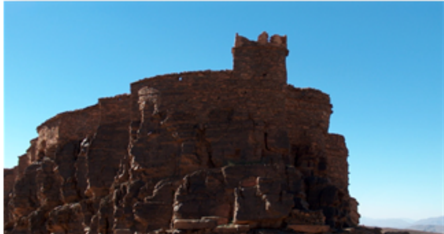
FIGURE 6. Casbah of agadir in amtoudi-Guelmim