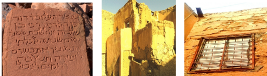
FIGURE 3. Annex 2 : Photos of local heritage resources Building of the jewish community in rural zone « Ifran » and the medina of Guelmim