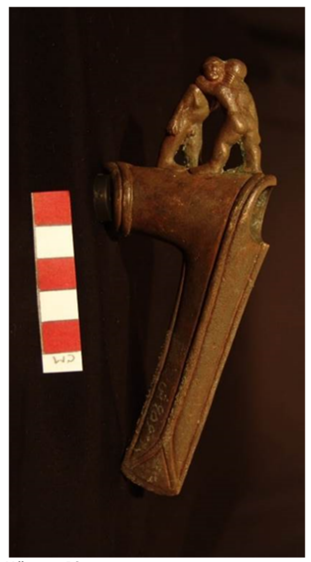
FIGURE 8. Bronze Axe belongs to 1th Millennium BC

Although the Greco-Roman wrestling is known as a French sport, this object reveals that the wrestling is mainly rooted in the Iranian culture.