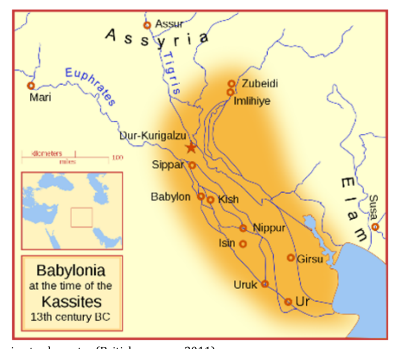
FIGURE 1. Eastern Mesopotamian trade routes (British nuseum, 2011)

Since the beginning of the second millennium BC, the people living in the Zagros valleys had made a rapid progress into new levels of culture and civilization due to political, economic, and cultural exchanges with neighboring civilizations in the east and the west. The connection of these tribes with the Mesopotamian plains was just not only hostile, but a decisive factor in the natural and geographical privilege of the Zagros Valley, which provides for animal husbandry, hunts and, in some instance, farming for its dwellers. On the other hand, Mesopotamian trade routes crossed the eastern regions of the Zagros range (Figure 10), so although they were the sworn enemies of the Mesopotamians, they were forced to trade with the Kassite, and thus they were affected by their more civilized neighbors (Barzin, 1348)."