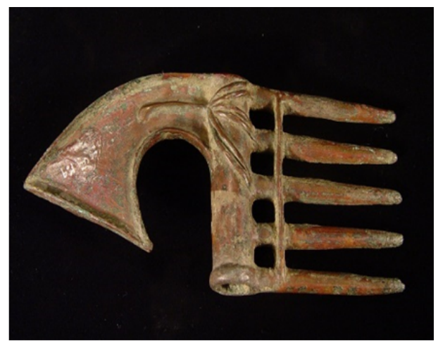
FIGURE 5. Bronze Axe belongs to late 2th Millennium BC

In the first object, the axes that have vertical blades themselves are very diverse. In some of these axes, the blade is rectangular and in some, it is a trapezoid, and in others, it is a half crescent. In some of these On the opposite side of the blade, several rods is generally parallel to the length of several centimeters, but the precision cannot be commented on the application or decorative aspect of these designs. In some other axes, the axial blade crater slipped and sharpened. But in the mouth of the circle, the blade breaks the blade out of hand. In this case, there is definitely no comment about its function. The whole was especially given (Figure 5).