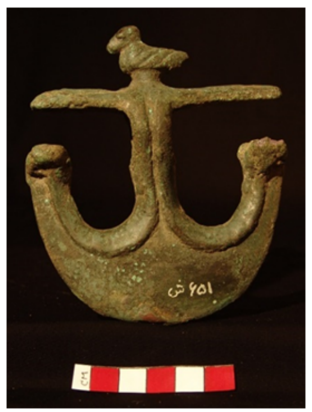
FIGURE 10. Bronze Axe like an anchor

power and immortality. Barzin (1348), But the interesting thing about this axe is that there is no place as a bunch or hook that shows that this ax has a sacred and ritual aspect and it is not a practical aspect for it. The size of the axe is very small, which ultimately can be used as a plaque and decorative object. From the bottom of the bird, two parallel tapes are connected to the two ends of the head, which, of course, are very abstract and difficult to diagnose, but the head is like a lion and one's head like a snake.