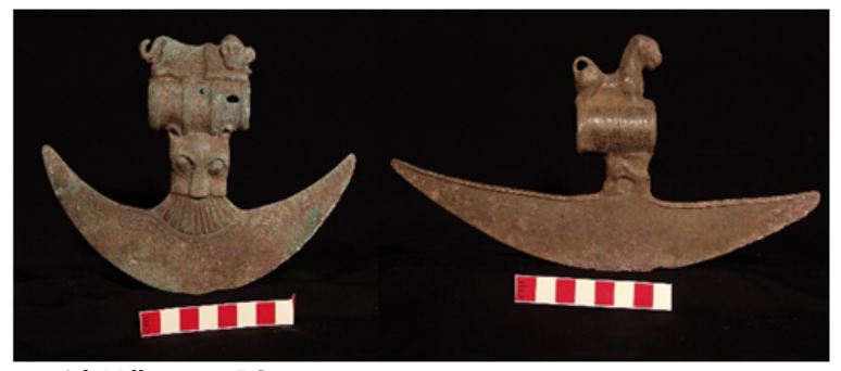
FIGURE 11. Bronze Axe belongs to 1th Millennium BC

• These axes mentioned below, the lion is made to sit, and on the blade side, which has been coming out from the mouth of another lion, the eight-leafed flower came out of the mouth, which was engraved on the blade's body (Figure 11).