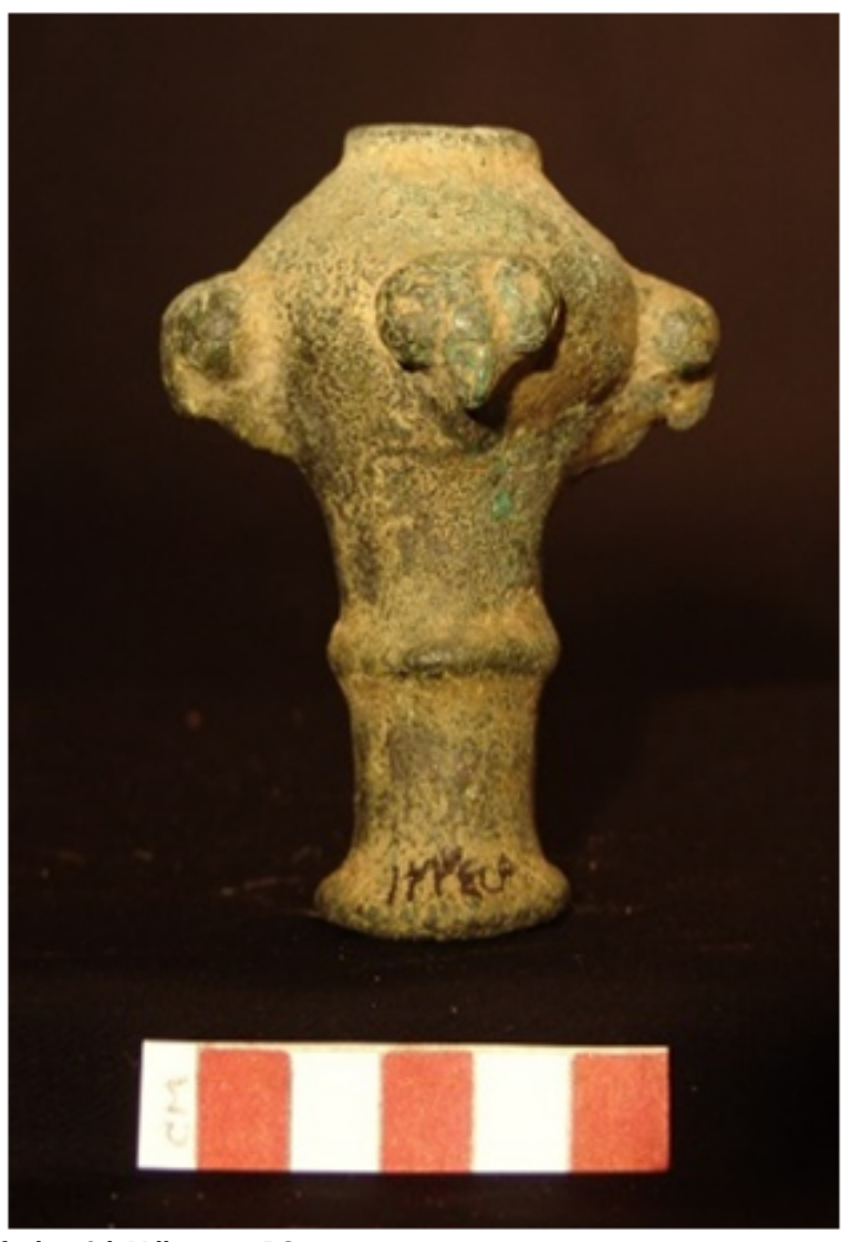
FIGURE 3. Bronze head mace for late 2th Millennium BC

ing method and has a high accuracy in all directions. Considering the position of the handle and the wand and the weight of the part that is on the top, and the ram's type of processing has increased the severity of the impact, there is also the possibility of using the wand in the war. The ram in Luristan has been a symbol of endurance and power, and its horns were a symbol of fertility. (Hatam, 2005).