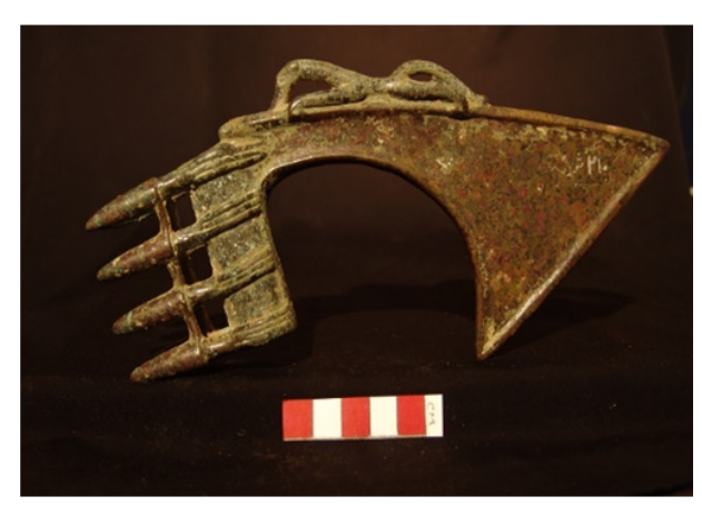
FIGURE 6. Bronze Axe belongs to late 2th Millennium BC

It probably is thought that axe put into a certain ones' hand as a head cane, it could be a more likely option than we thought it was a tool used on this axe In the war, the location of the handle is very small, which makes the handle of the axe in terms of the small diameter, and this small handle allows the use of the tool to eliminate this axe since its power of knocking is very weak.