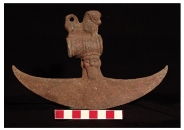
FIGURE 12. Bronze Axe belongs to 1th Millennium BC CONCLUSION

domesticated of the horse, and this effect Standing horse show.