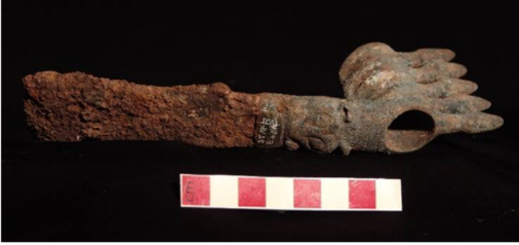
FIGURE 9. Bronze Axe belongs to 2th Millennium BC

for a blade that is more damaging than rings and destructive effects because it is linked to the ground and Moisture and stone have created deep scratches on this blade. On this blade, there is a picture of a goddess with two horns, which is probably carved with a sign of sympathy (Figure 9).