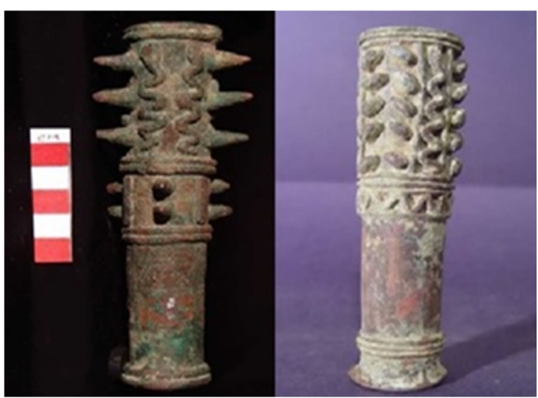
FIGURE 2. Bronze head maces for late 2th Millennium BC

Since the snake in the ancient world was a symbol of rain and water and the clouds and the rains were dominated by the snake (Cirlot, 1388).