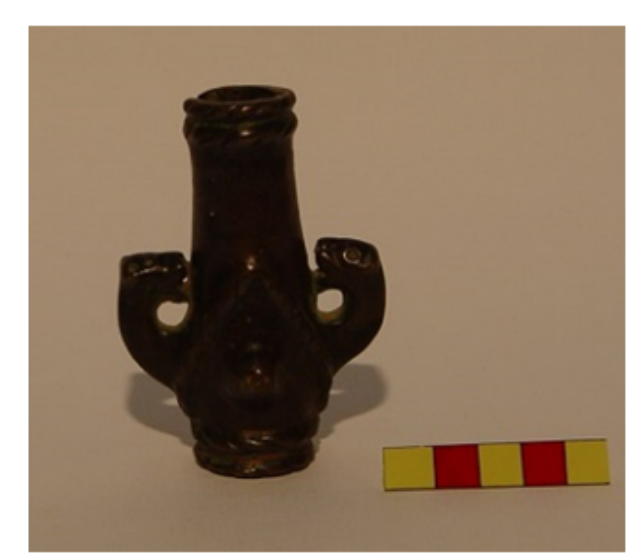
FIGURE 4. Bronze mace for 1th Millennium BC