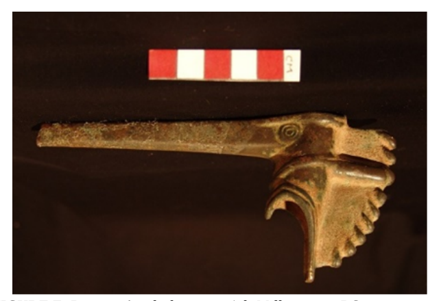
FIGURE 7. Bronze Axe belongs to 1th Millennium BC

• The other type of these axes has a narrow vertical blade and a handle with treads on the opposite side of the blade like a tumbleweed (Figure 7). In general, these types of axes are similar to the rooster, and in some cases, even their eyes are engraved on the handle. Due to the small size of the blade, one can guess that these types of axes have not been utilized, and probably given that the rooster in ancient Iran had been numbered from the holy fowl and had been a Courier Soroush, and that the Mehr religion also gave the rooster to Mitra (Dadvar & Mobini, 2010).