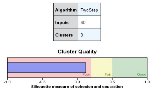
FIGURE 2. Model summary view

settings. However, in spite of several tries, the result still shows poor fit.